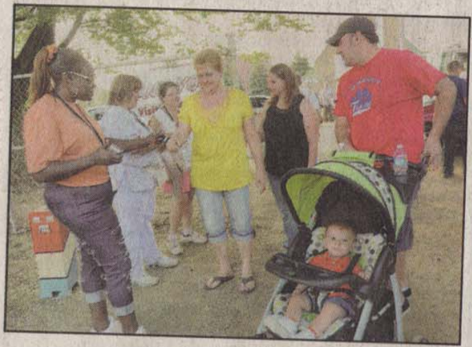
Volunteers collect money and stamp hands at the Village gates.