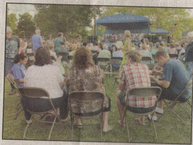
The International Village crowd gathers in small circles around the stage.