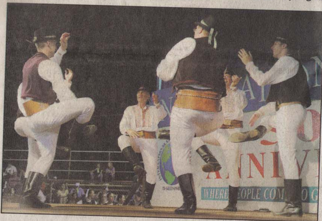
A group of men from the PAS Slovak Folk Ensemble step in unison during one of their many fast-paced dance numbers.