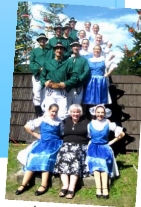
PÁS Adult Group Detva, Slovakia, 2009